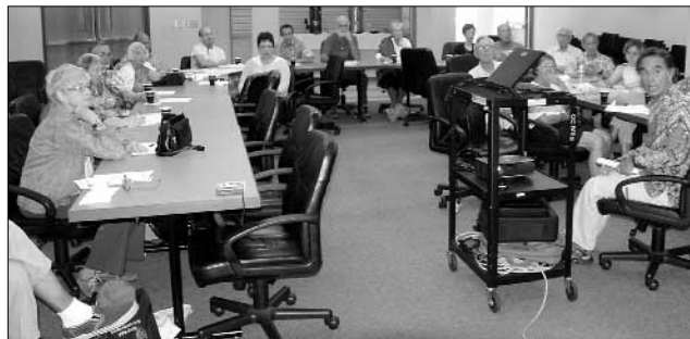
"Asia Today" Series - China, Korea, & Myanmar. Participants representing a variety of professions and academic disciplines in the Honolulu community joined CAPE for the Twenty-second "Asia Today" Series.