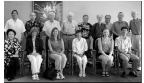
CAPE supporters posed after lunch in celebration of CAPE's re-accreditation.