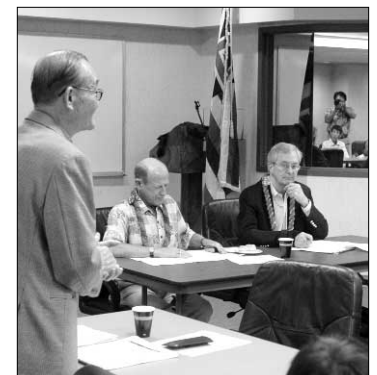
On-site evaluation/interview meeting during ACCET team's visit to CAPE for its re-accreditation.

The end of March this past year brought with it great news for our CAPE family. With the help of our devoted staff, faculty, members of the board and advisory council, and alumni and community supporters, CAPE was awarded a new five-year re-accreditation by the Accrediting Council for Continuing Education and Training (ACCET). This official recognition was the highest possible level of achievement to be granted by ACCET. We are very proud to have passed their thorough review and inspection process, which included an evaluation of our institution's mission, policies, and implementation of programs, followed by an on-site assessment by a team of inspectors from the U.S. mainland. CAPE was highly praised for the vision, effectiveness and high quality of our instructional programs. We were also commended for the outstanding learning environments, techniques and purpose that we provide to both our current and alumni participants