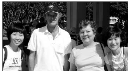
English teachers with their host families.