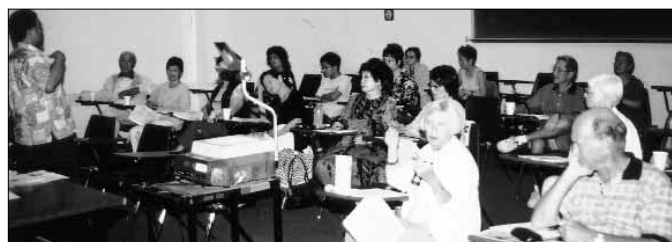
Participants from various professionals and academic disciplines joined CAPE at the 14th Language and Culture Seminar, Fall 2003.