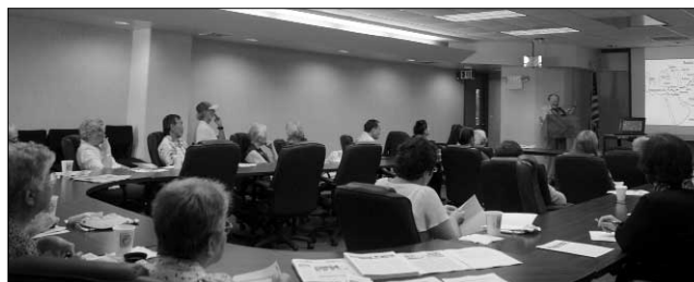
Participants from various professional and academic disciplines joined CAPE at the 21st Language and Culture Seminar, Fall 2010